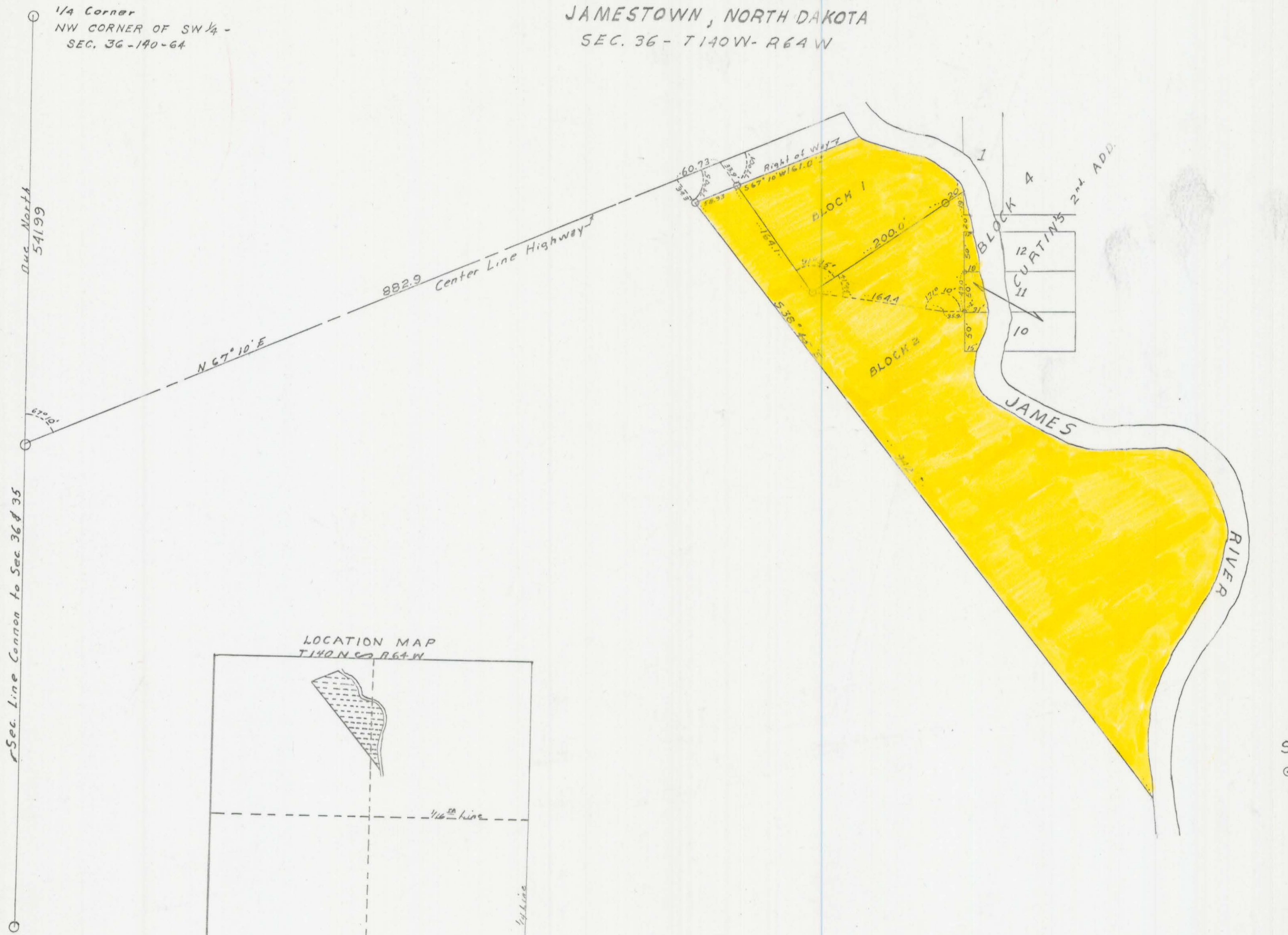
LOCATION MAP T140N S2 R64W

1/4 Corner NW CORNER OF SW 1/4 - SEC. 36-140-64