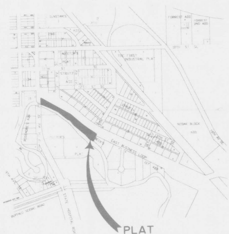
PLAT LOCATION VICINITY MAP

LEGEND ○ EXISTING IRON ● SET No. 5 REBAR WITH 1/4" PLASTIC CAP — LOT BOUNDARY